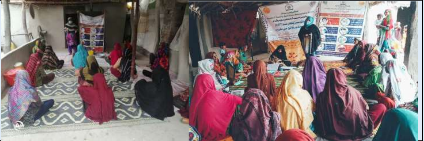
Covid-19 awareness session at VO Umer Soomro UC Peero Lashari Badin