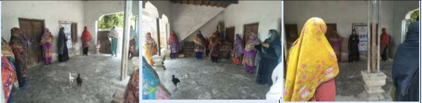
Sessions on precautions of COVID -19 ,Hand Wash activity and social Distancing activity.Village : Mughul sethar Union council :kamoon shaheed .Tehseel : ubaaro District Ghotki. 16 women of the community participated in the session