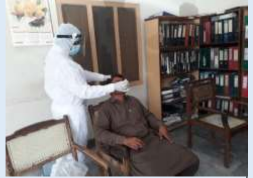
COVID-19 Testing at Thari Waah District Khaipur