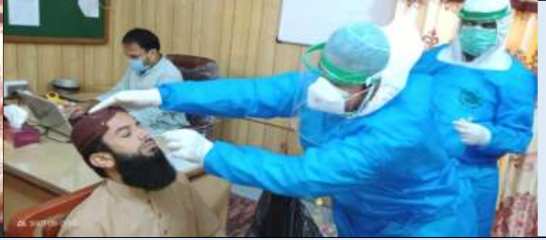
COVID-19 Testing of SRSO Team at Kashmore @ Kandhkot Office by Health Department