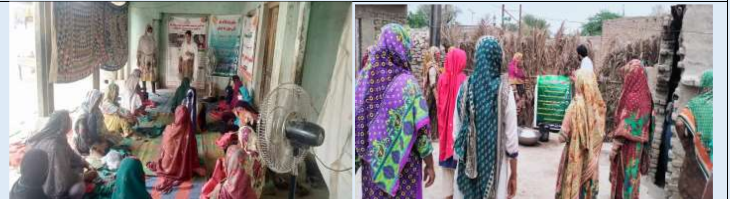
COVID-19 Awareness sessions with community and VTP participants at Khairpur